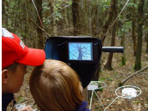
Figure 7. An example of a quicktime movie being shown on the periscope

While in the woodland the children could find physical organisms, such as woodlice, and go back to the periscope to find the icon associated with these and access more information about the lifecycle or habitation of it. They could also look at artificial examples of the organisms found in that part of the woodland, that were presented in hanging Petri-dishes, that were attached to the periscope.