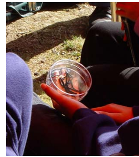
Figure 13. Bootlace fungus in Petri-dish

The two pairs of children were led back into the wooded area towards the periscope, and were asked to continue their reasoning as they walked. As with the acorn scenario, they were asked to hypothesize what they thought would happen, and, in particular, whether it would have a detrimental effect. They were told that when they reached the wooded area with the periscope, they would be able to see on the screen what would happen over time when these two tokens (representing the two types, respectively) were placed separately and together in the wooded area.