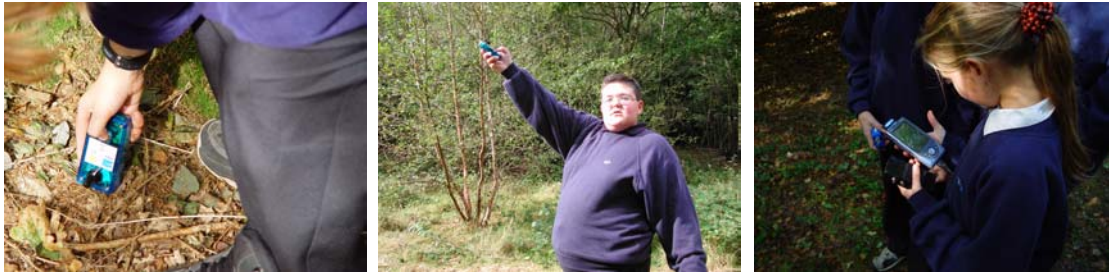
Figure 2. Using the probing device to find out the (i) moisture and (ii) light levels and (iii) reading the resultant visualisation on the PDA screen

The readings were re-represented as simple animated abstractions that were displayed on a PDA, showing the relative intensity of moisture or light (see figures 3 and 4). This allowed the children to rapidly discern how moist or light a part of a habitat was relative to the rest of it.