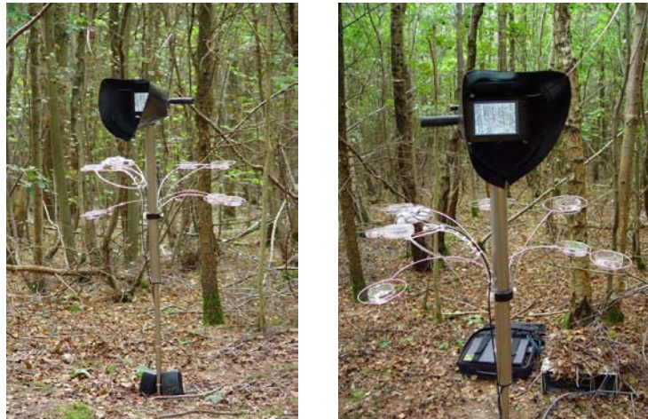
Figure 6. The periscope

A special periscope device (see figure 6) was built that enabled the children to view other processes occurring in the woodland habitat that would be impossible to see with the naked eye or ear. The aim was to provide abstracted information (visual and audio) of life cycles already present in the woodland. These were presented as quicktime movies and animations showing the changes over time; which organisms lived there and the interactions that took place between them.