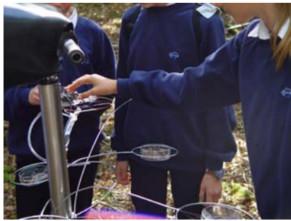
Figure 12. Placing the fictional spider next to periscope

Following a discussion of this scenario, the children were asked to think about what would happen if two different types of creepy organisms, that they did not expect and had not come across in the wood, were introduced into the wooded habitat. These included a large white hairy spider and a nasty form of bootlace fungus (see figures 12 and 13). These were artificial, but designed to look and feel as realistic as possible. The reason for selecting these two organisms and presenting them in this way, was to make the experimenting stage of the learning activity to be authentic, slightly scary and engaging, enabling the children to suspend their disbelief that they were artificial, for the purpose of the learning activity. Our previous research has shown that the genre and look and feel of artefacts that children are given to hold, wear or use is critical as to whether they are willing to go along with the make-belief of the exercise associated with them. This is especially so for the 10-14 year old range, where we found children of these ages to be embarrassed and resisted having to put on cyberjackets, rucksacks or other wearables, that were perceived by them to be too girly(or boy)-like, too baby-like, or too geeky. User studies of what organisms children found interesting and fun were those that were scary and creepy. Hence, our choice of fungus and spiders.