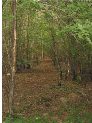
Figure 1. The woodland

the nature of the distributions and relationships of the organisms in the habitat, and in so doing facilitate the learners' ability to better integrate their disparate experiences and knowledge (Scaife and Rogers 2001).