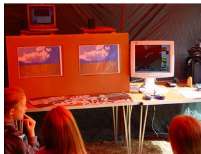
Figure 8. Pairs of children sitting around screen displays used in Phase 2 of learning experience

Following the exploratory stage, the pairs of children were brought together and taken into a ‘den’ (a makeshift outdoor classroom-like setting), where a large computer monitor and shared interactive display were provided (see figure 8). The aim was to provide a collaborative neutral environment that would allow them to report back to each other and reflect and consolidate their findings. In particular, the goal was to enable the children to step back from the physical action and to think more explicitly and holistically about the collection of readings they had collected in relation to the two habitats and the processes and relationships between the organisms within the habitats.