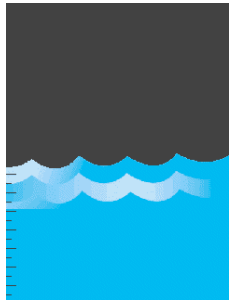
Figure 3. Moisture reading (medium level)

The readings were re-represented as simple animated abstractions that were displayed on a PDA, showing the relative intensity of moisture or light (see figures 3 and 4). This allowed the children to rapidly discern how moist or light a part of a habitat was relative to the rest of it.