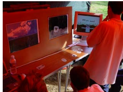
Figure 11. Feedback provided from tagged tokens

Following this task, the children were asked to generalize to another setting, specifically to hypothesize about what would happen to the organisms and their interdependencies that they had identified as being part of their habitat during the winter (the season they had explored their habitat was late summer).