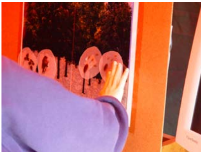
Figure 10. Token use on interactive whiteboard

They were then asked to consolidate what they had learned about their habitat, by building a picture of it, using paper 'tokens' representing the organisms, which they stuck to the interactive board (see figure 10). These were tagged and when placed onto the board were read by a tag reader, which resulted in feedback being presented on the accompanying computer screen at given times. A number of tokens were provided, from which the children had to select the correct combination that they thought made up the habitat (e.g. chiffchaff + caterpillar + brambles) and to explain the nature of the relationship between them (e.g. the chiffchaff makes its nest in the brambles and eats caterpillars and other insects.). If they selected the incorrect combination, an animation appeared on the computer monitor, providing feedback to this effect (see figure 11). When they got the correct set of tokens and placed them in the correct locations, the system would provide positive feedback to this effect.