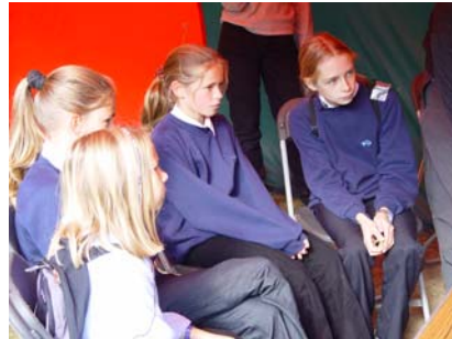
Figure 16. Looking at visualization in the den area

physical experience of collecting data, providing a good overview of where the children had each been and what the big picture looked like, enabling them to recognize the differences between findings and habitats. Hence, this session enabled the children to consolidate the knowledge gleaned from the activities they had been partaking in the wood (see figure 16).