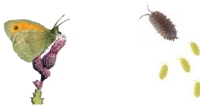
Figure 5. Example digital images presented on the PDAs

Occasional digital information was also presented to the children via the PDA, about a particular aspect of the habitat, depending where they were within that habitat. Various sounds, images and voice-overs were triggered to appear through the use of pinger technology (Randell and Muller 2001), depending on their location in the habitat. A sound would be triggered first, which was transmitted through wireless speakers hidden in the habitat. The sound was followed, five seconds later, by the presentation of an image and voiceover on the PDA. The purpose of providing this combination of distributed digital information was threefold: (i) introducing the unexpected – the sounds were intended to be fun and attract the children's attention to a specific part of the habitat, (ii) enhancing the perceptibility of aspects of the woodland, e.g. by visualising processes that would be difficult to see or hear otherwise and (iii) providing explicit information conveying the interdependencies between the organisms. Eight sounds in each of the two habitats could be discovered, for example, the butterfly sipping nectar, the chiffchaff eating a caterpillar and woodlouse scuffling. Associated with these were eight images and voice-overs that appeared on the PDA, for example, a thistle growing, the butterfly feeding, woodlouse having babies (see figure 5). An example of a voice over was: "woodlice and millipedes live in and feed on the fallen leaves".