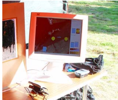
Figure 9. Display showing aggregated probe readings for the two habitats

to the others, enabling them to make comparisons between their own readings and across the different habitats.