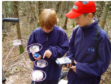
Figure 15. Interest in contents in Petri-dishes

One unexpected finding was that the incongruous appearance of the periscope in the thicket of the wood informed the way the children approached the device, itself. Unlike the other mobile and pervasive technologies, which were used to present the augmented digital information to the children, the periscope was neither pervasive nor portable. It was a quite distinctly hi-tech “thing” which the children “found” during their journey through the woods. Often the children approached it almost warily, but with great interest – the form itself, and the different elements contained therein seemed to intrigue them (see figure 15). The children generally seemed to first approach the Petri-dishes which protruded like flowers or leaves from the stem of the, otherwise shiny stainless steel and rubber, periscope. The contents of the Petri-dishes stimulated discussion about what each element was and what kind of role it might play in the wood or where it could be found.