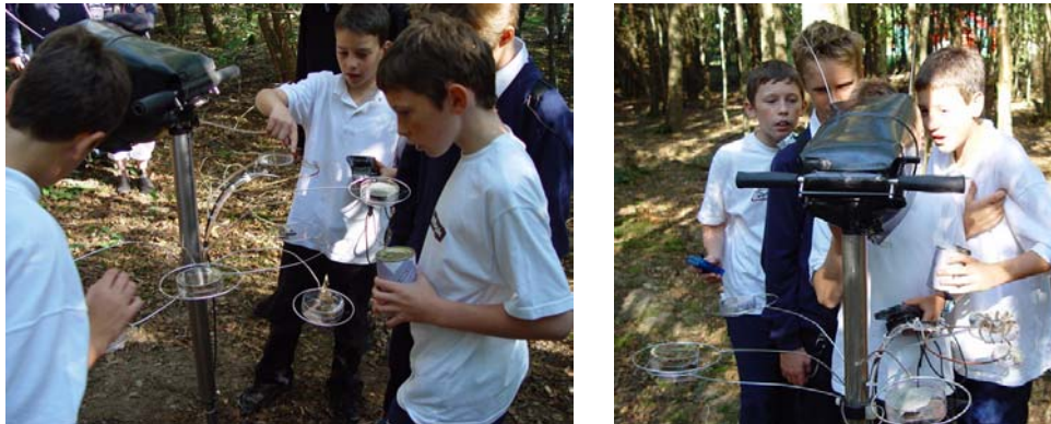
Figure 17. (i) Collaborative experimenting with tagged artefacts (ii) and observing the outcome

A key issue our research has raised is the pros and cons of using different ways of delivering digital content to users/children while moving around in an open space, looking at the physical environment around them, both with a naked eye and ear and through using various devices. Unlike, sitting in front of a computer or TV screen, where children's attention is largely drawn to one focal point, we designed the experience so that their attention would be constantly switching between different demands and things going on. As well as navigating the area, looking and hearing at what was going on around them and talking to each other, we required them to listen to unexpected sounds playing from hidden wireless speakers, other times to talk to the distant facilitator about what they had discovered, other times taking a reading, while other times to look at the content appearing on the PDA. At first, they found these overlapping and competing demands a bit bewildering and would leave what they were doing in 'mid-sentence' and move onto the next demand. Once the children got the hang of the different demands, however, they started to decide for themselves more how to deal with the interruptions and different demands on their attention. For example, if they were taking a reading or listening to a voice-over and the facilitator on the walkie-talkie started talking to them, they would choose to ignore it till they had finished what they were doing.