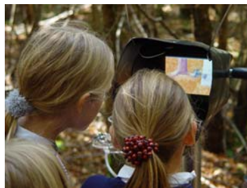
Figure 14. Using the periscope

As mentioned above, one of the most successful outcomes of the first stage of the learning experience was the combined use of the probing device and PDA to collect moisture and light measurements. The pairs of children made frequent probes for both measures, usually with one child doing the probing and the other holding the PDA, reading off the visualisation. Sometimes, both children would look at the PDA screen together, and other times the one holding it would tell the other what they had seen on the screen. The children took many different sorts of readings, e.g. probing different sorts of leaves and bark, widely exploring their habitat to find different areas and things to test in order get a range of levels. They would try to work out initially where in the habitat, would be most moist and light or most dark and dry, and then test their predictions by using the probe device. Having control over the probing device meant the children were actively involved in deciding when and where to take readings. The digital information resulting from their actions was tightly coupled with the activity and the children readily understood the connection between the two.