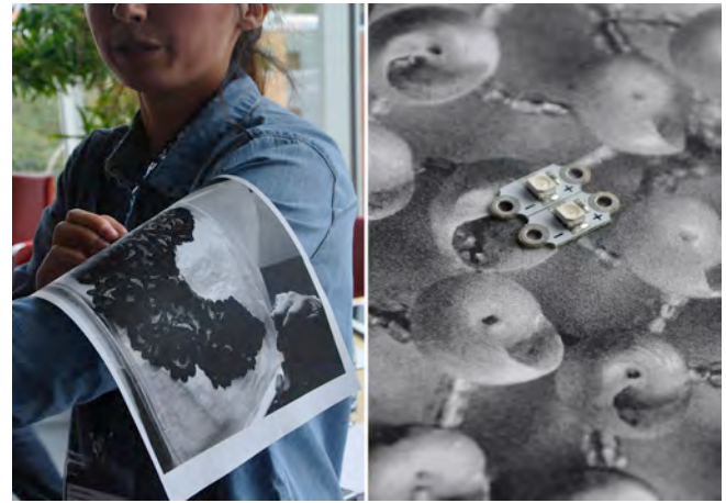
Figure 5. 'Embodying Past Expressions': a photocopy of a vintage embroidered embellishment is explored on the body.

When we apply the EDI framework questions we find the disruption in this method is the use of disposable photocopies to represent otherwise fragile inaccessible historical garments and ornamental details. Bringing historical elements into play, in this way, with current technologies destabilises our understanding of how technology might be applied to the body. It allows us to conflate ways that people have worn garments and ornamental elements in the past with current technological potential. What emerges from this destabilisation are new