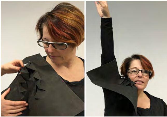
Figure 3. ‘Topology of the Fabric’: draping laser cut fabric directly on the (moveable) body

When applying our EDI framework questions to “Material Props in Context” we note the disruption is caused by how the chosen material is experimentally added to the body in context, without regards for the material’s previous purpose (c.f. Figure 2). Pulling a material out of its usual context destabilises our understanding of that material’s potential; including how it can be used in relation to the body, (and) in a chosen context. What emerges from this action is a re-contextualisation of material properties and experiences and thus new perspectives on the material’s potential in contextualised use. The “Material Props in Context” method thereby embodies material potential.