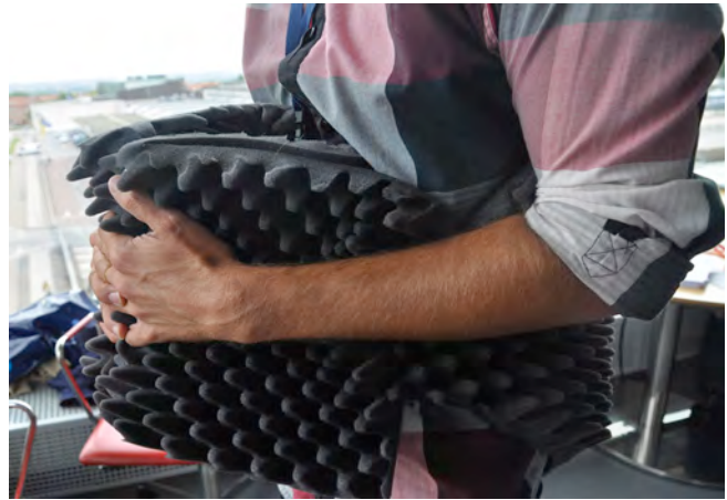
Figure 2. Material Props in Context': Exploring new experiences with a piece of sound insulating material.

In this section we describe each of the eight EDI methods, using the authors own words as well as our experiences from the workshops. We then unpack them further using our framework. Each method is described using this same two-step manner for easy reference and navigation. As addressed in the previous section the first two questions of the framework are used to unpack the act of estrangement and the last question serves to place the method within a genre of theory and related work. The third question – the question of what emerges from the act of estrangement – is useful as means to understand what the methods can be used for and thus also as a means to organize a description