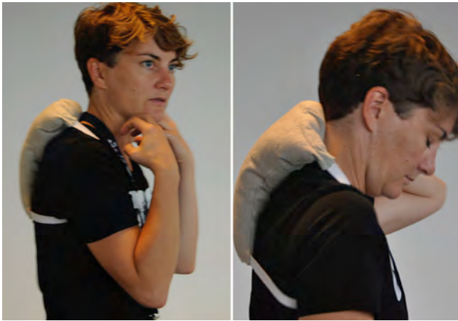
Figure 7. ‘OWL Bodyprops’: embodied exploration of a prop while being interviewed about the desires it inspires.

dynamic potential of social relations between human and non-human actors.