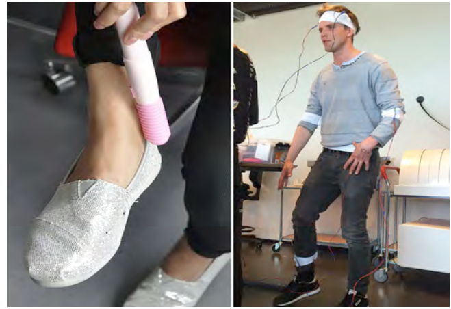
Figure 4. ‘Props for Embodying Temporal Form’: experiments with vibration. L: an off-the-self intimate vibrator R: a custom made system to compose vibrating rhythms.

When we apply the EDI framework questions to the “Topology of the Fabric” it becomes clear that by mechanically altering the characteristics of a fabric –