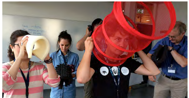
Figure 1. Participants in the first workshop enacting the “Material Props in Context” EID method for the first time.

Our framework has been developed over two workshops held in conjunction with two HCI conferences (Aarhus Decennial 2015 and TEI 2016 [69, 63]). At the workshops embodied design researchers guided all participants through their methods (c.f. Figure 1) then engaged in a broad