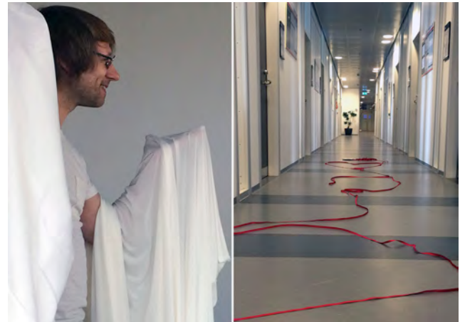
Figure 8. ‘Props for Undesigning’: re-situating everyday actions by means of L: a tube of cloth, and R: a ribbon.

This method disrupts the body by strapping an unfamiliar object to it. With the addition of the simplistic operational questions, this combination destabilises where the attention is and thus what can be imagined using everyday reasoning. What emerges are radical imaginings grounded in desire, which can lead to new concepts for embodied technology design. This method thus embodies latent desires.